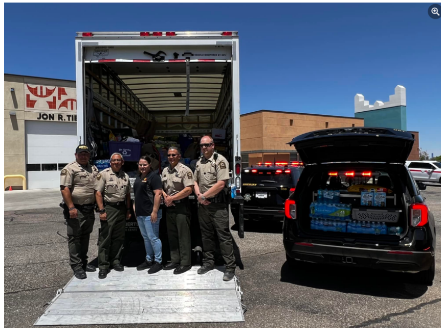
Sheriff's office delivers aid to first responders and people displaced by the fires

Click here for more information on the sheriff's office.